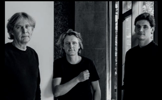
design studio segers

truly take control of our high end quality. Right here at home we smell the sent of natural fabrics, leathers, woods and stone, we feel the artisan vibes. No matter how far our Snooze travels to its new home, we will always cherish our local craftsmanship. This is how we do things. This is our tradition.